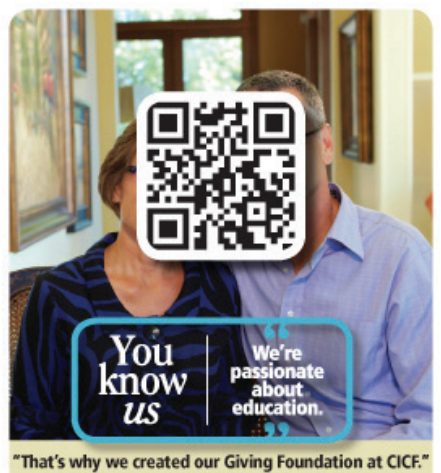
That's why we created our Giving Foundation at CICF." Find out who we are. <u>Click here</u> or scan the QR code.

A snap to open and simple to use, Giving Foundations make your philanthropy more strategic - which means your gifts are more powerful, and more likely to create the results you're passionate about. Available with a tax deductible investment of $25,000 - $499,000, Giving Foundations provide professional planning, development and guidance from our experienced Philanthropic Advisors. You'll also receive the research and reports you need for focused, effective philanthropy and easy online access. With all of the benefits of a private foundation at a fraction of the cost, CICF's Giving Foundations are the smartest way to give. They wouldn't have it any other way!