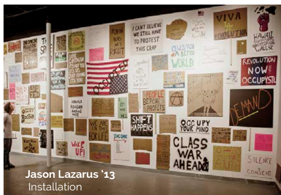
Jason Lazarus '13 Installation